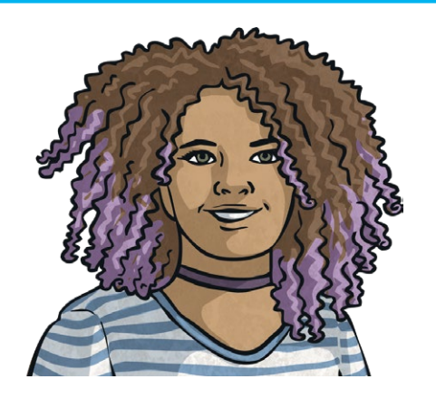
I want to continue my family business. It was started many years ago by my great-grandfather and I want to take the business from strength to strength.