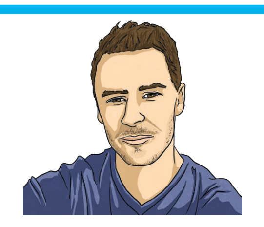
I want to be able to provide for my family. I want to be able to take them on holiday and buy luxury items.