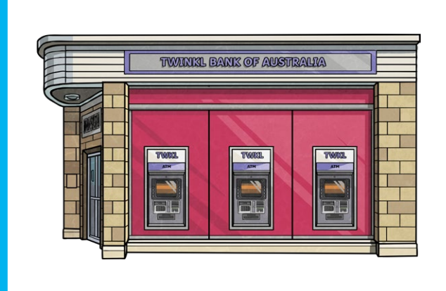
Investment Banker Salary: £50,000.