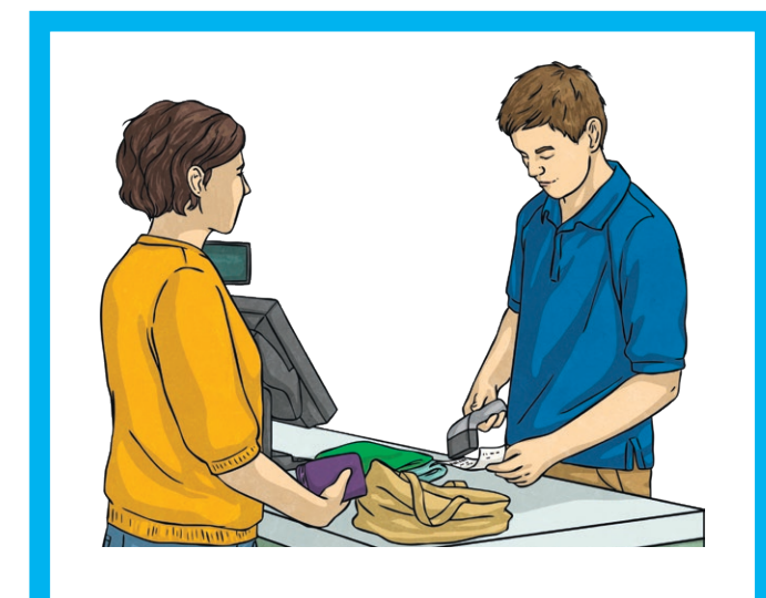
Family-run clothing business, established 1920.