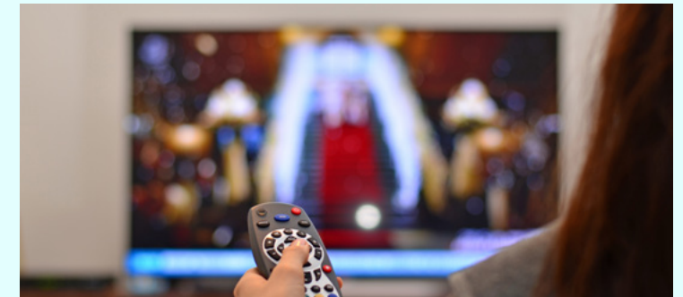
Catchy songs, jingles or catchphrases