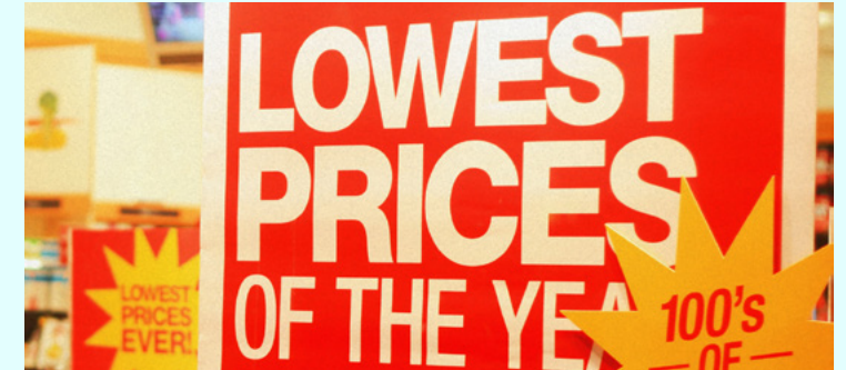
Using persuasive language like 'best ever', 'brand new', '5* reviews'