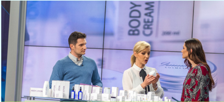
Repeating an advert many times in one week on TV