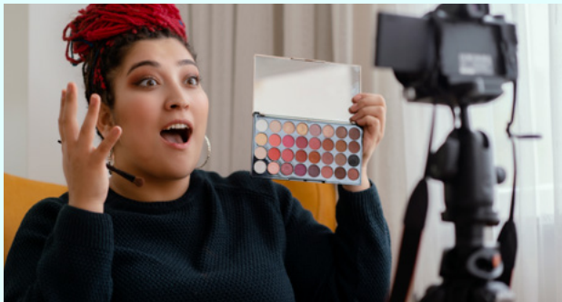
Using a celebrity or a famous person to promote the product, often through social media