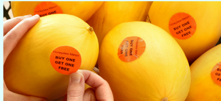
Buy one, get one free